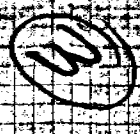
CHART NO. WH