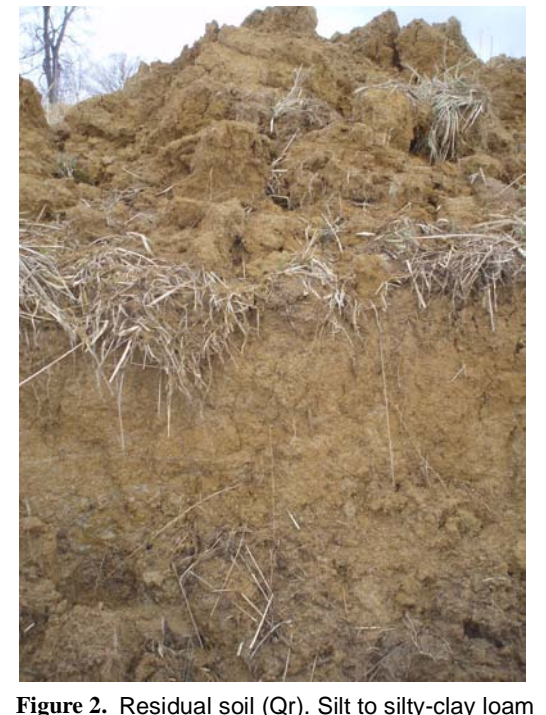
Figure 2. Residual soil (Cr). Silt to silty-clay loam covering ridgetops and gently sloping shoulders. Many places soil is mixed with coarse silt, soft, sticky light-brown to orange loess.