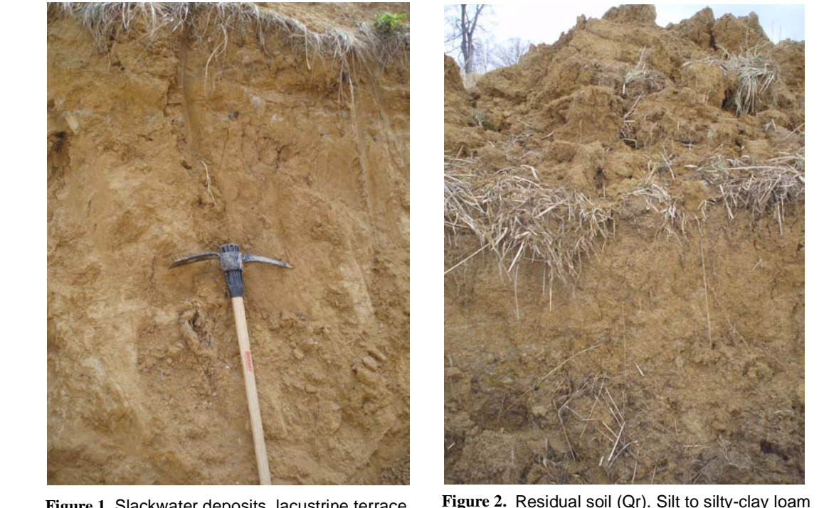
Figure 1. Slackwater deposits, lacustrine terrace (Qa11). Exposure of reddish-orange sand (lense of outwash?), friable with quartz pebbles, 8 feet thick.